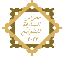
EXHIBIT APPLICATION FORM معرض المشاركة للطوابع 2023 SHARJAH 2023 STAMP EXHIBITION